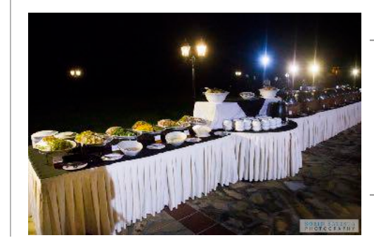
SEA CLIFF RESORT & SPA, OUR VALUED EAGLE SPONSOR PROVIDED A DELICIOUS BUFFET TO ALL OUR GUESTS

But the fun did not stop there. Sunset on the beautiful west coast brought drinks and cocktails provided by ZMMI, and a delicious and huge buffet provided by Sea Cliff Resort and Spa, drawing the 150 guests back for more over and over again.