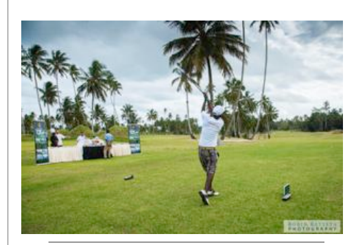
FOUM, SPONSORED BY ZANLINK TEE'ING OFF ON #1

Various BIRDIE SPONSORS provided delicious snacks and drinks along the course.