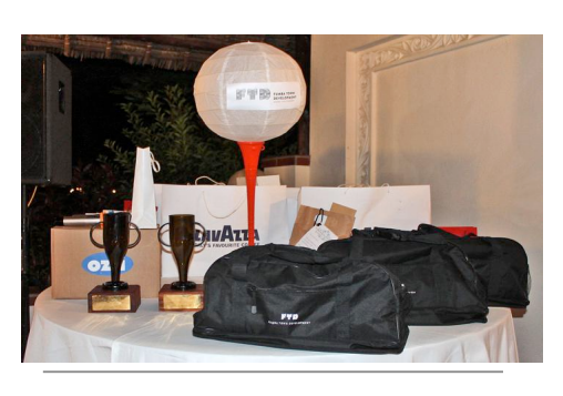
EACH PLAYER RECEIVED A GOODIE BAG WORTH $150 SPONSORED BY THE PAR SPONSORS