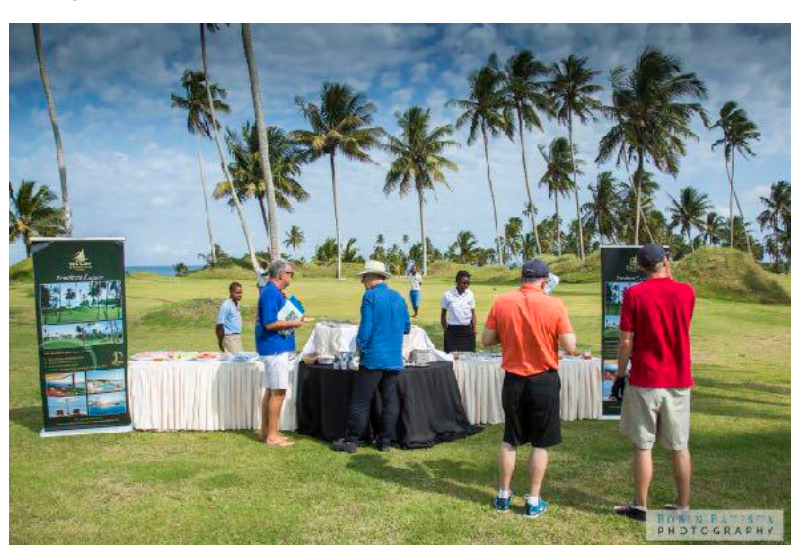
SEA CLIFF RESORT & SPA, OUR EAGLE SPONSOR SERVED BREAKFAST ON #1

Various BIRDIE SPONSORS provided delicious snacks and drinks along the course.