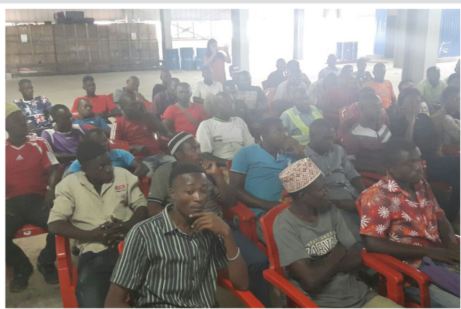
East Coast Liquid Storage, 8th July 2016