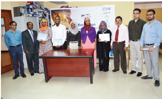
East Coast Liquid Storage Reward and Recognition Ceremony 28th June, 2016