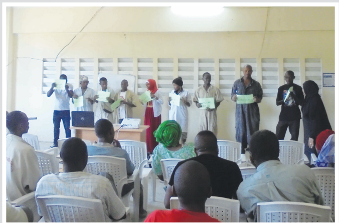
21st Century Food and Packaging, 11th July 2016