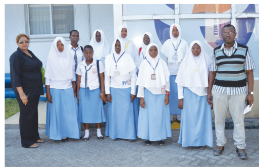
Chamazi High School students with East Coast oils and Fats factory HR Officer and Health & Safety Officer

The students of Chamazi Day Secondary School visited East Coast Oils and Fats Limited – our Oils and Soaps manufacturing plant for a project study. They were awed by the cleanliness and automation of the big production plant. Their curiosity and the eagerness to learn encouraged them to keenly observe both the oil refinery and the luxury soap making processes. Whilst keeping in mind the safety and health instructions provided to them, the students took a tour of the grounds to see the off-loading points and dispatch points.