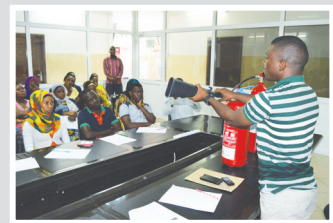
A-One Products and Bottlers workers in a fire fighting session