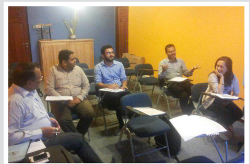
Training sessions in progress at our state-of-the-art training centre in the City