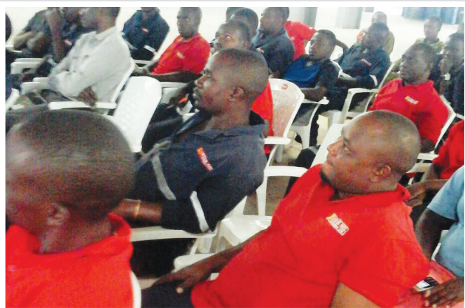
Star Oils, 25th June 2016