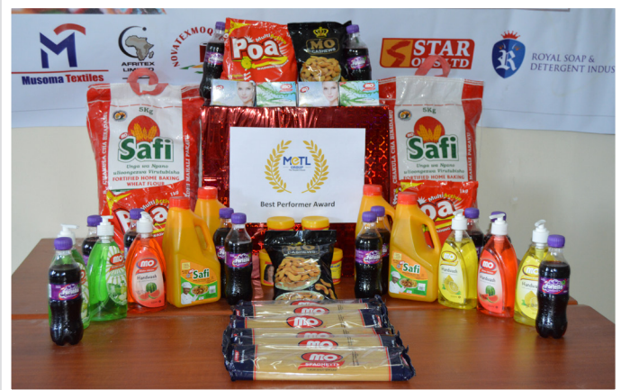
Gift Hamper contents