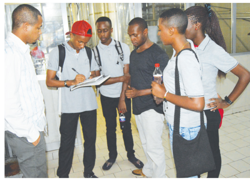
Tusiime Secondary School students with A-One Products and Bottlers HR Officer

On the whole, they found their visit to be productive as they got to know the facts, process and ingredients involved in the production of juices and soda which they relish a lot