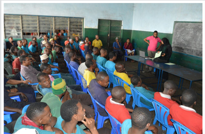
21st Century Holdings, 25th June 2016