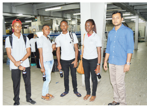
Tusiime Secondary School students pose with Mo Cola drinks in a group photo at A-One Products and Bottlers factory