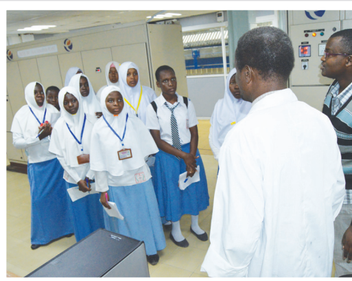
Chamazi High School in attentive mode as they listen to their tour guide at Our East Coast oils and Fats factory