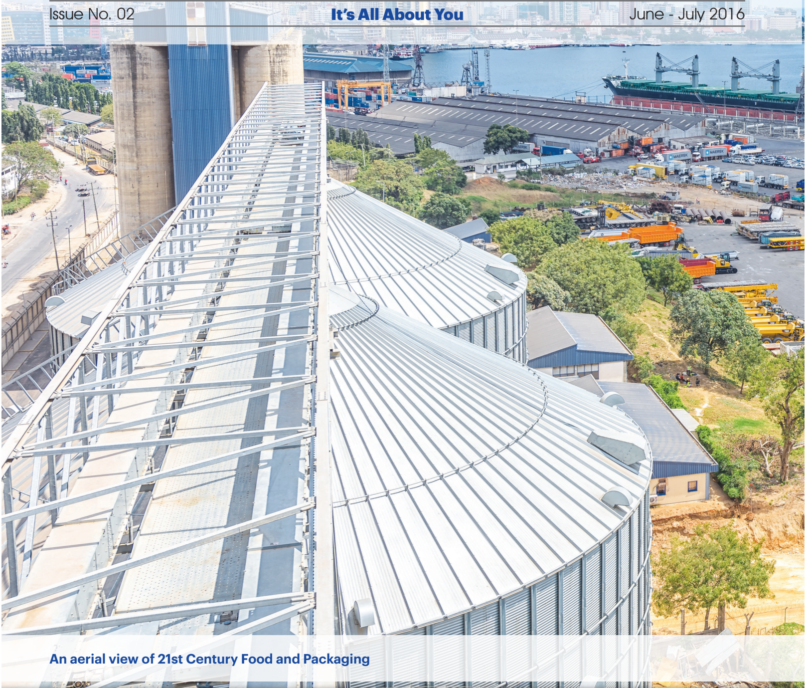
An aerial view of 21st Century Food and Packaging