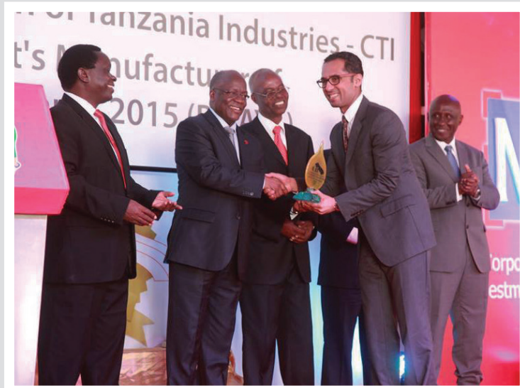
CEO of MeTL Group, Mr. Mohammed Dewji, receiving the President's Award from H.E John P. Magufuli, the President of the United Republic of Tanzania

On 17th June, the Secretary General of TUICO (Tanzania Union of Industrial and Commercial Workers) recognised two of our units: East Coast Oils and Fats and 21st Century Textiles in Majira, Mwanachi and The Guardian, congratulating the management and employees for this achievement.